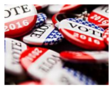
Who Will Millennials Vote for? This Analysis...