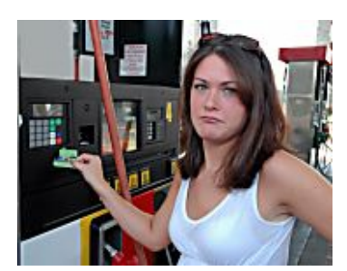
People in Heavy Credit Card Debt Could Be In For A...