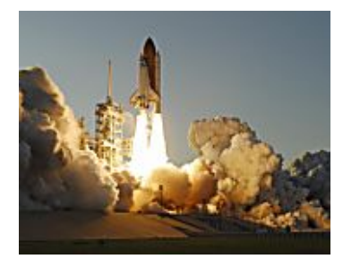
These Are Tomorrow's Leaders U.S. Chamber of Commerce Foundation